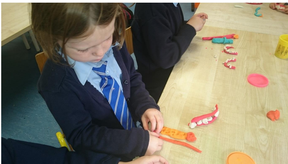
Making teeth with play dough.