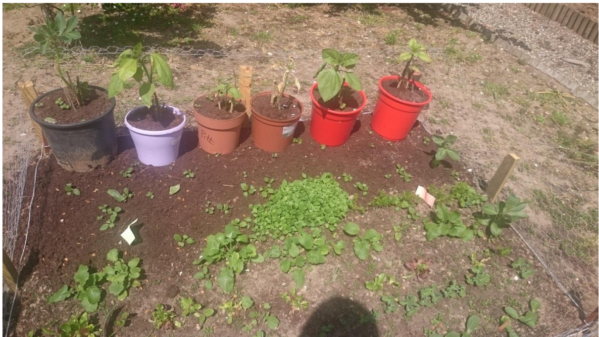
Our outdoor vegetable patch