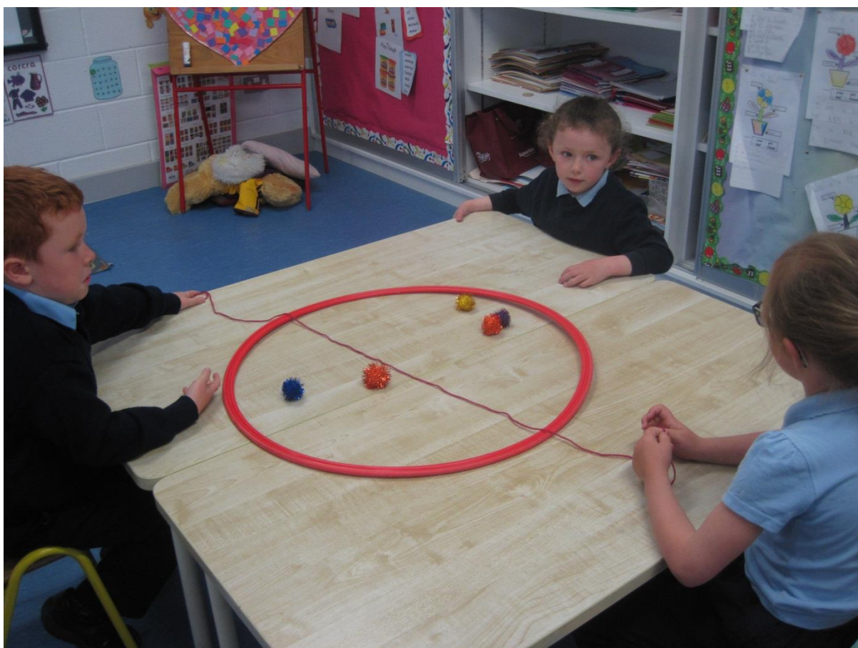
Making number 5 in different ways