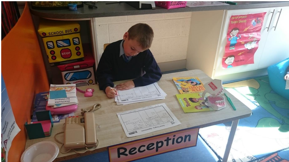
Receptionist hard at work.

In March our Aistear theme was the Dentist. Our role play area was the dental surgery and the children had great fun pretending to be visiting the dentist. The different jobs they had were receptionist, patient, dental nurse and dentist. The receptionist had to write down the appointments and check what was wrong with the patient. The patients sat in the waiting room where they could read books while they waited. The dental nurse assisted dentist. We were lucky to have a visit from a dental nurse who taught the children the proper way to brush their teeth.