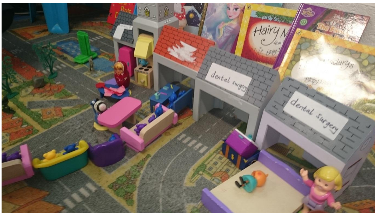
Small world dental surgery.