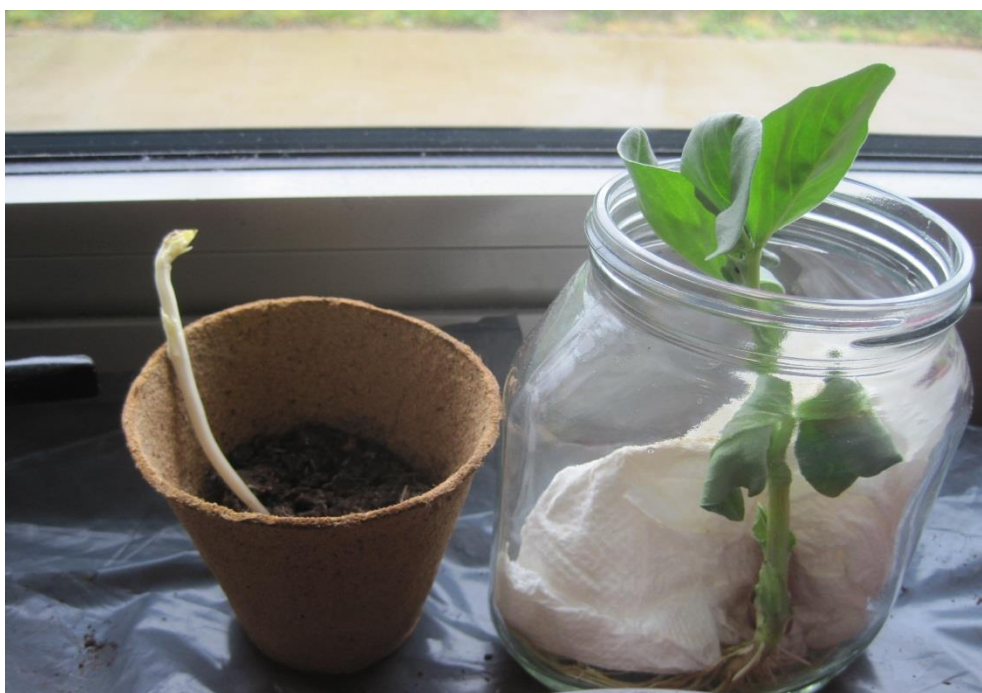
We observed roots and shoots