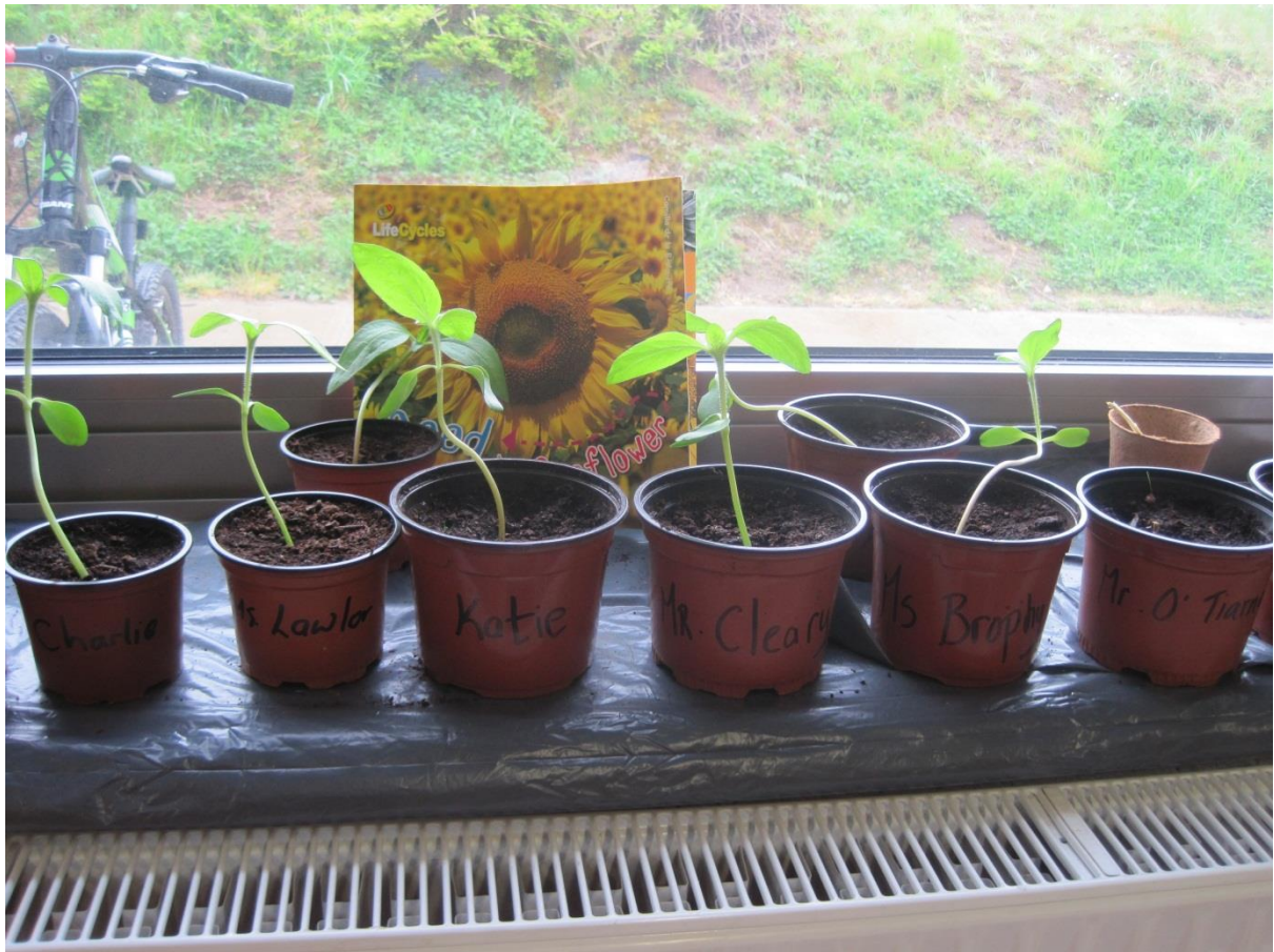
Everyone, including all the staff sowed a sunflower seed