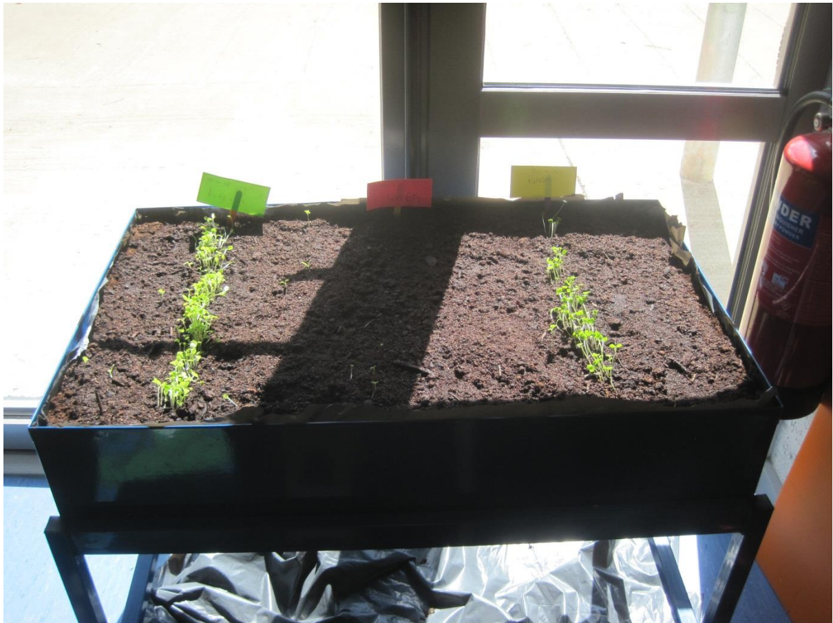
Our sand pit vegetable patch