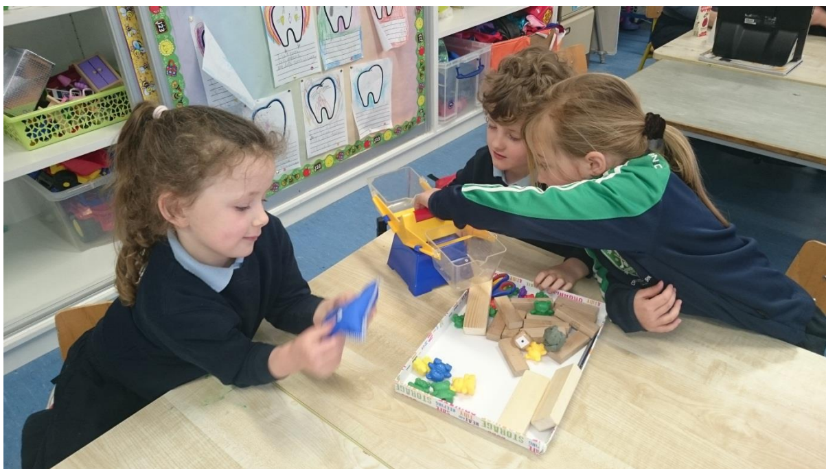
Fun weighing and balancing different objects