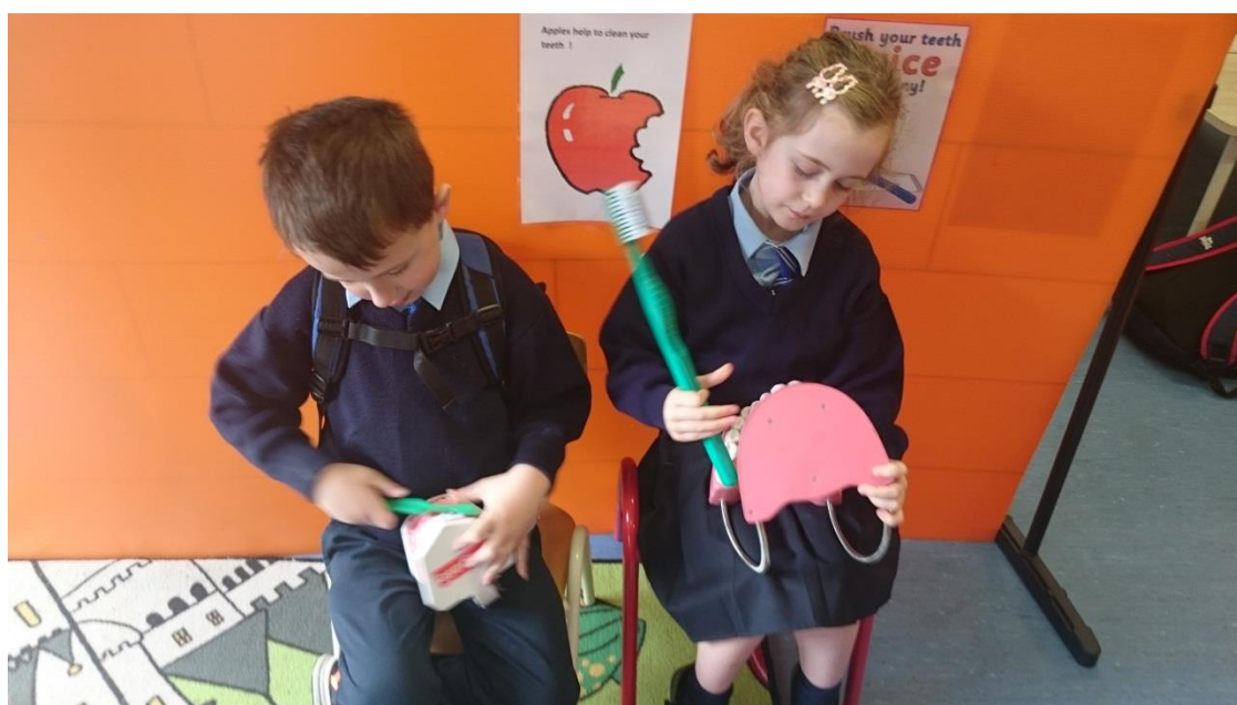
Brushing teeth in the waiting area.